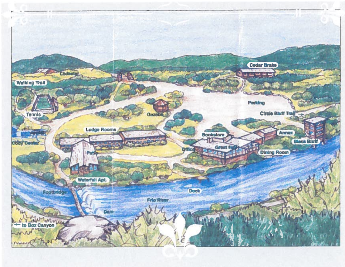
Pictured at left: Laity Lodge Retreat, near Kerrville, Texas

Number of adults: _____ @ $ _____ rate = total cost $ _____