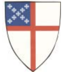
SHIELD OF THE EPISCOPAL CHURCH

CLOSING PRAYER: Thank you, God, for all the people who give their time to do all the work of our church. Amen.